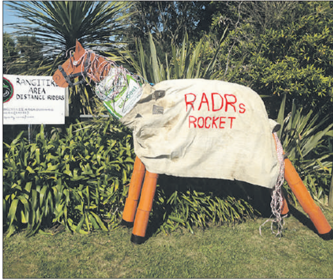
Horse scarecrow Radr's Rocket, was the community winner - created by the Rangitikei Distance Riders group_in Wellington Rd..