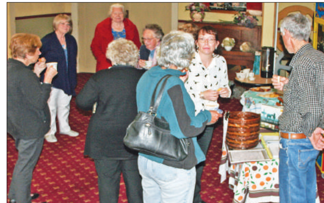
Armistice commemoration attendees in Taihape enjoy tea and biscuits and chat around several story boards displayed in the Taihape Majestic Theatre foyer.