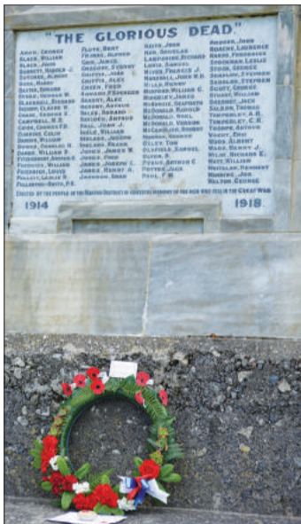
The WW1 fallen listed on the Marton cenotaph.