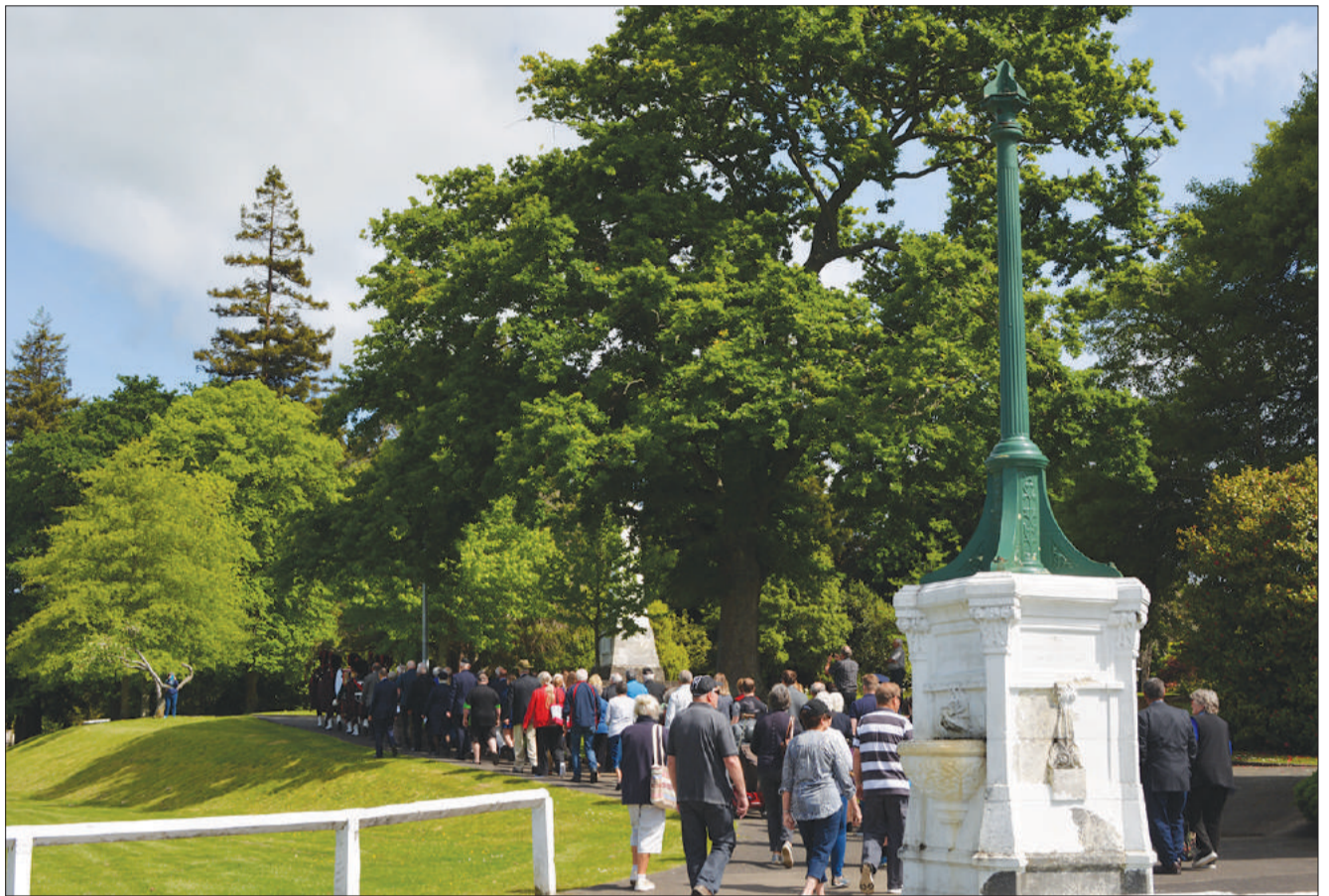
On Sunday, a parade of RSA members and locals made its way through Marton Park to the World War 1 cenotaph for a service on the centenary of Armistice Day - passing a Boer War memorial on the way.