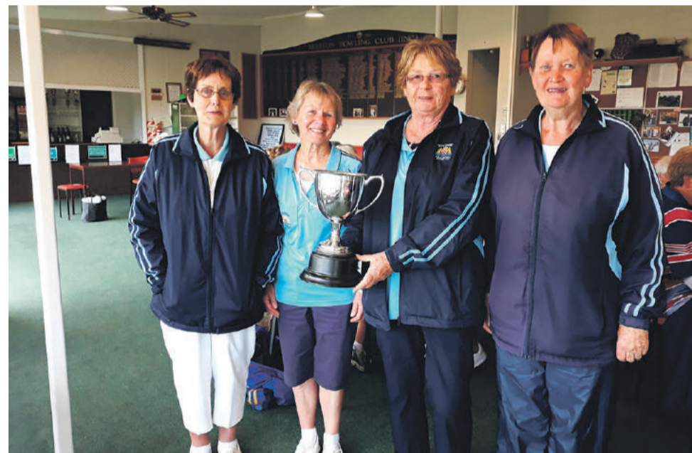
Above: Simonsen Cup tournament winners - Aramoho Bowling Club.