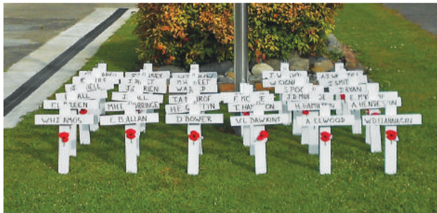
Crosses displayed outside the Mangaweka Fire Station to remember the 33 fallen townsmen.

Both towns lived up to the ode... "we will remember them."