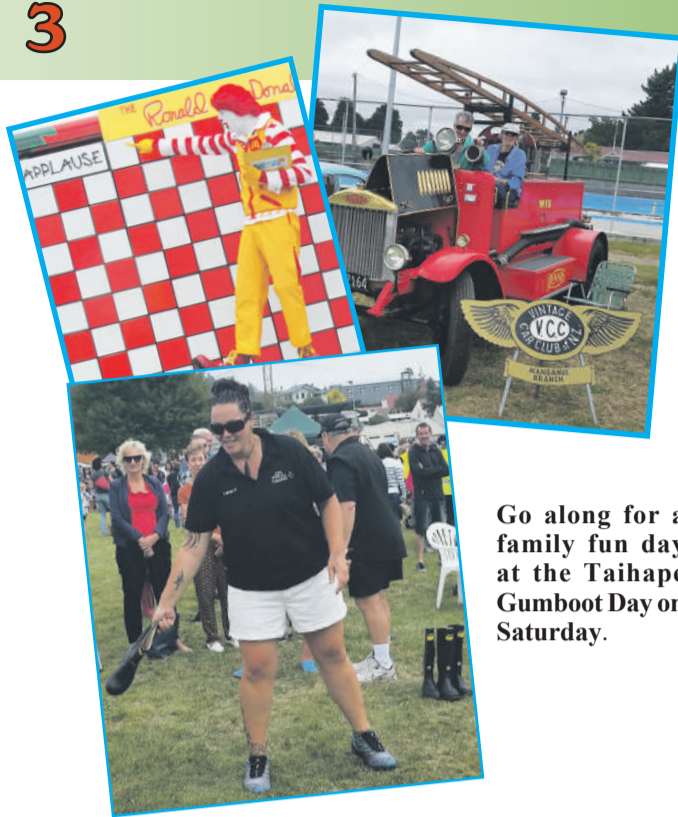
Go along for a family fun day at the Taihape Gumboot Day on Saturday.

The adjacent Taihape swimming pool is open for free and the popular skate park is also open during the day from 10am. See the Taihape.co.nz website for up to date information on Taihape Gumboot Day.