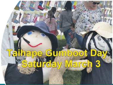
Taihape Gumbboot Day Saturday March 3