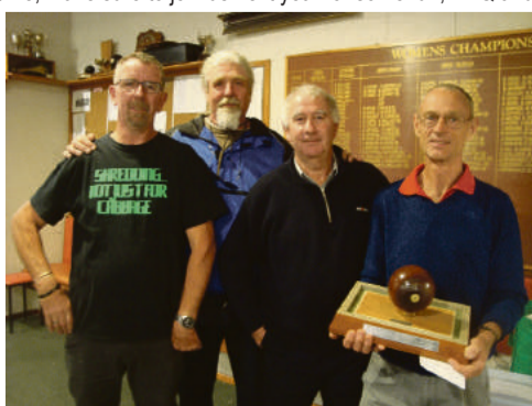
Sport continued on pg 11...