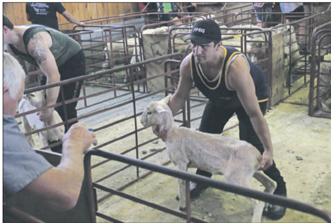
In the pens, a pen boy holds a sheep for the judges inspection.