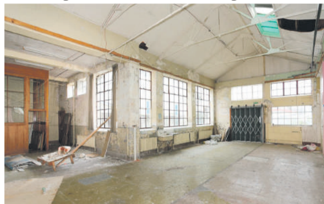
The building was partially renovated.