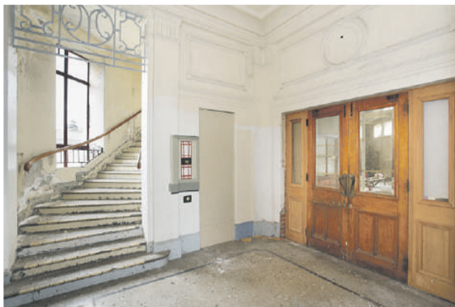
The original character of the building is still intact