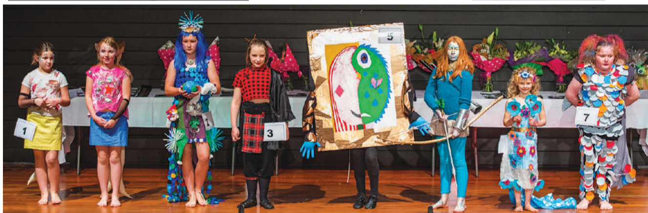
Line up in the Junior Animation Explosion category.