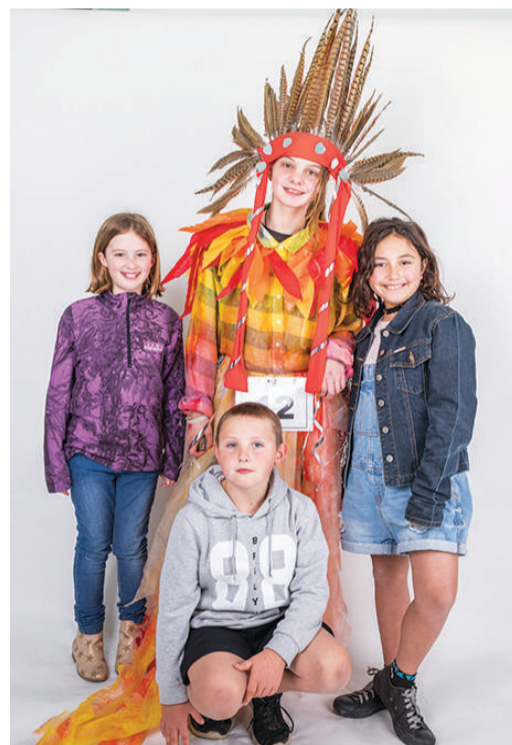
Junior winner Sanson school - It's all in the detail entry Phoenix Rising.