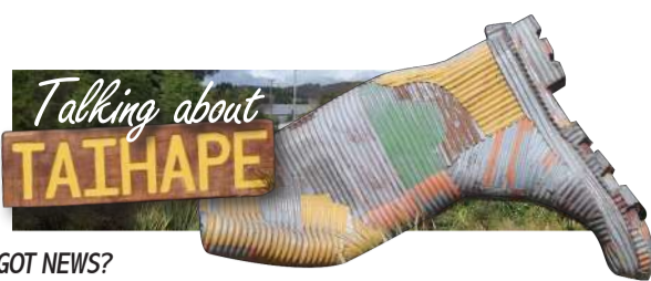
GOT NEWS? 06 327 7881

"Many riders have found out the hard way that clothing price is not necessarily a good indication of the level of protection it provides them.